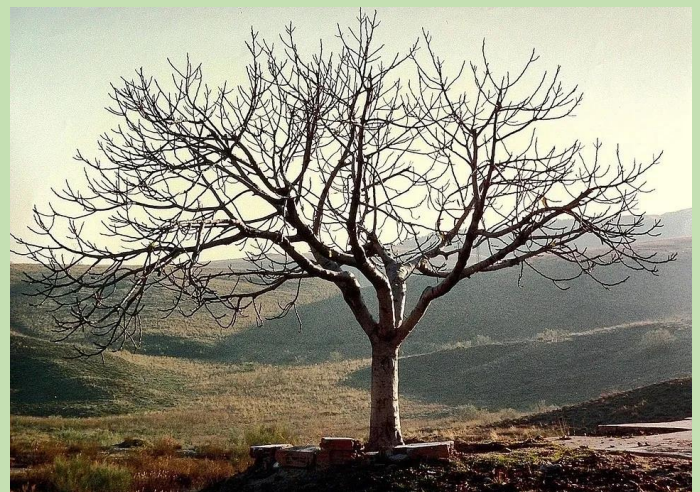
Winter has come.

Blackall Range Uniting Church Maleny Uniting Church, Montville Uniting Church, Palmwoods Uniting Church